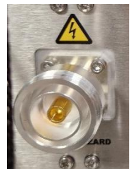
7/16 RF output