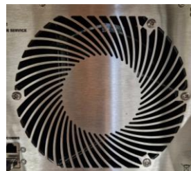
Smooth air exhausts