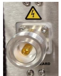
7/16 RF output