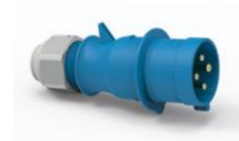
Option a) 200-240Vac, 4 pin plug (No neutral)