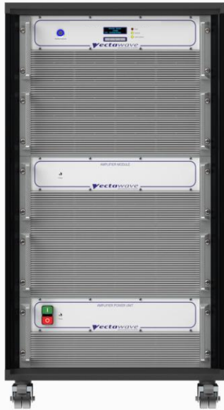
Typical P1dB (W)